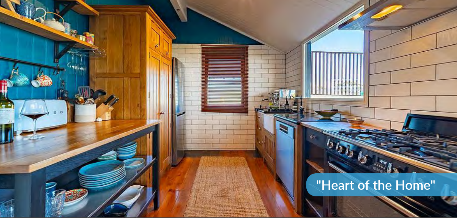
"Heart of the Home"