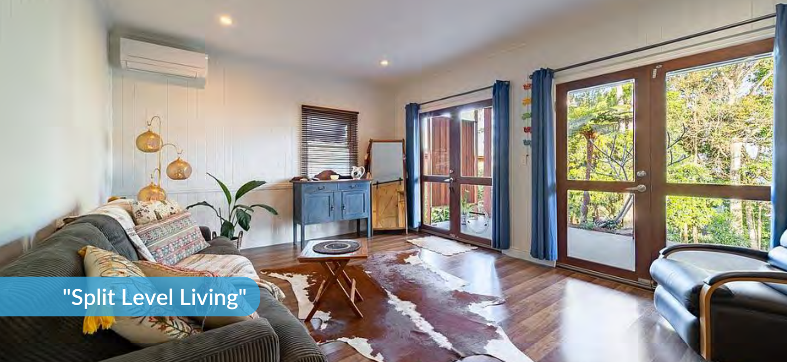
"Split Level Living"