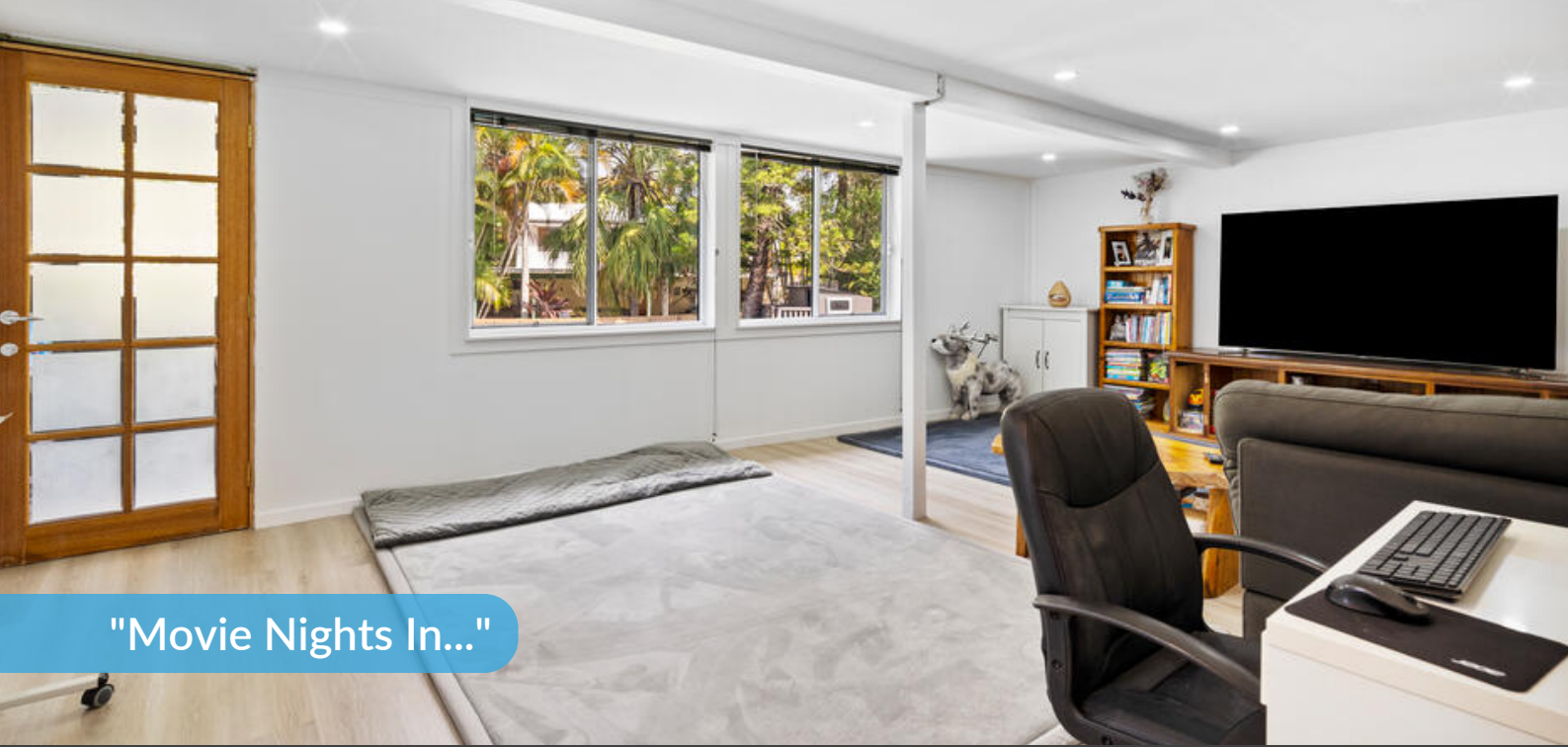
"Movie Nights In..."