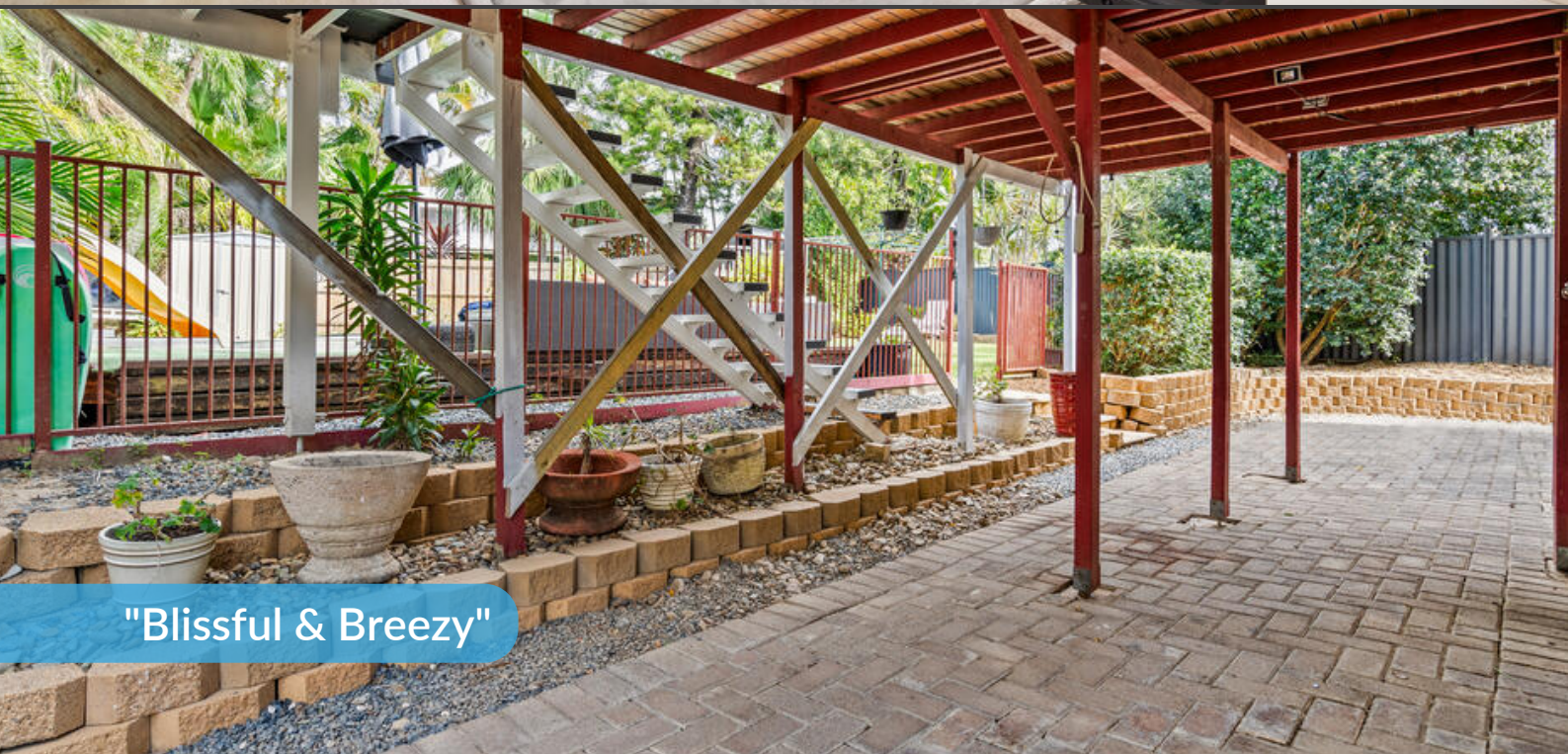
"Blissful & Breezy"