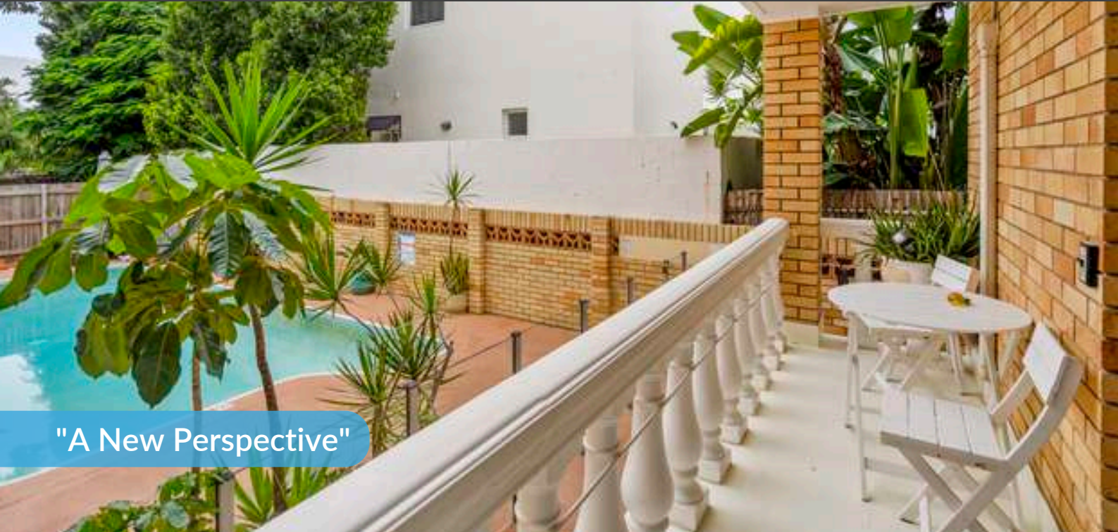
"A New Perspective"