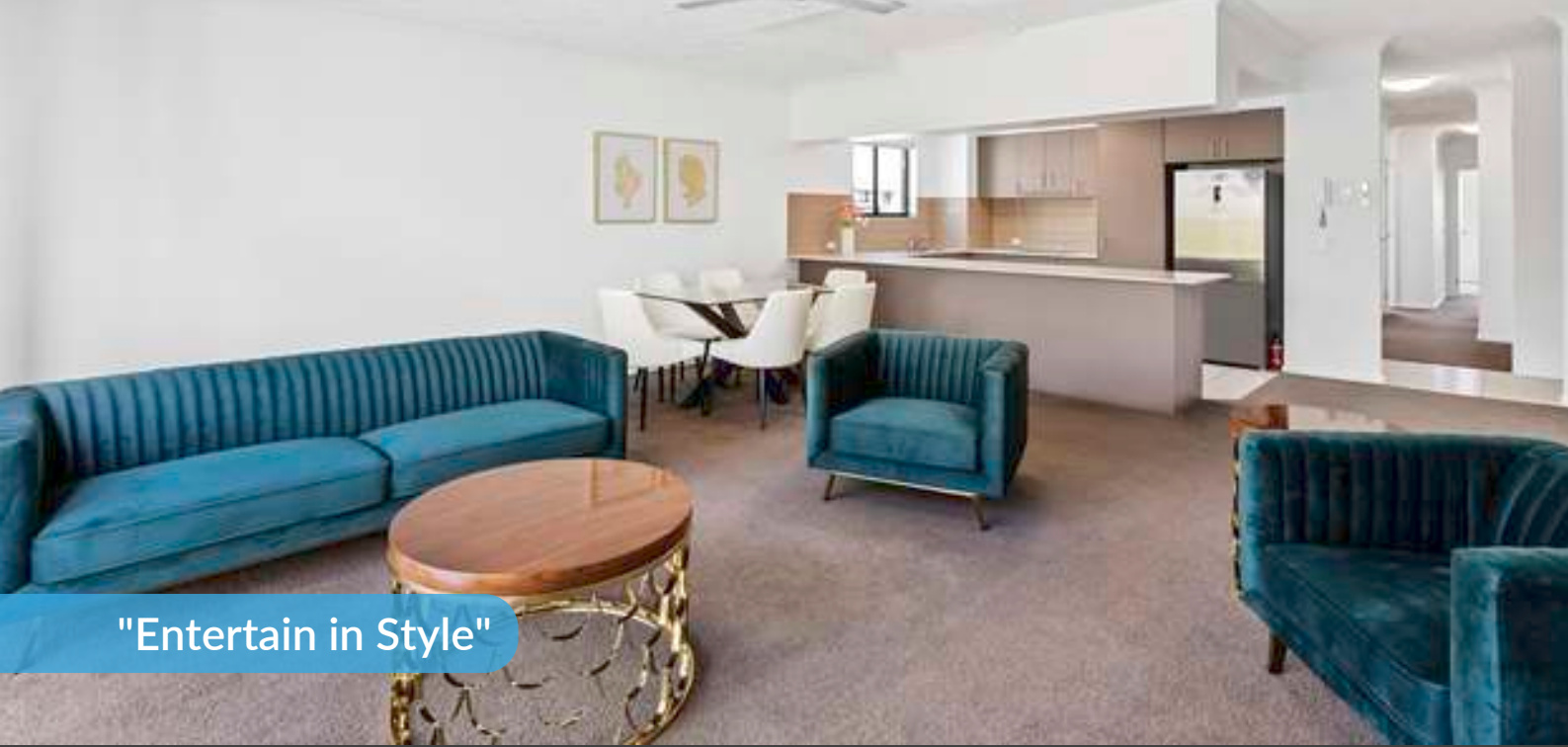
"Entertain in Style"