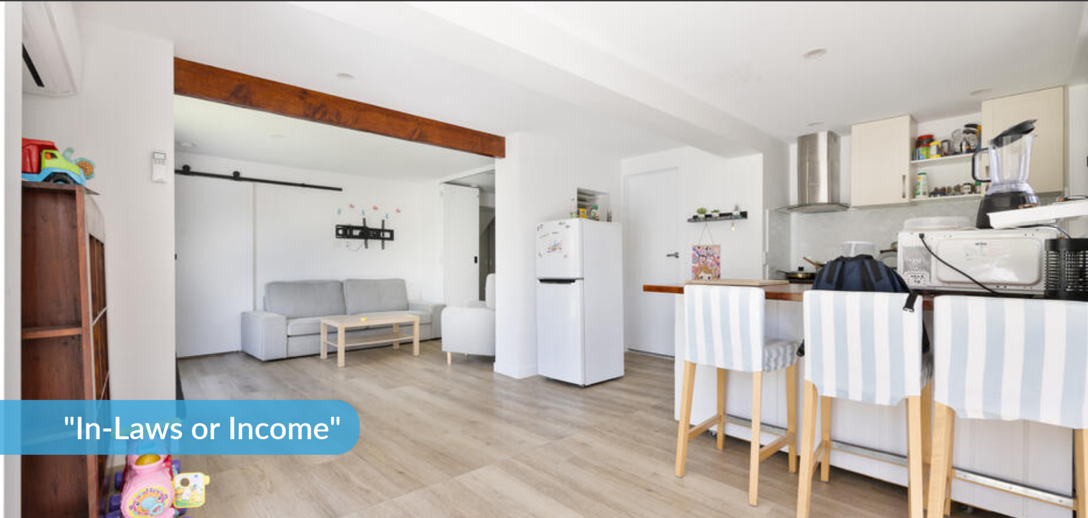
"In-Laws or Income"