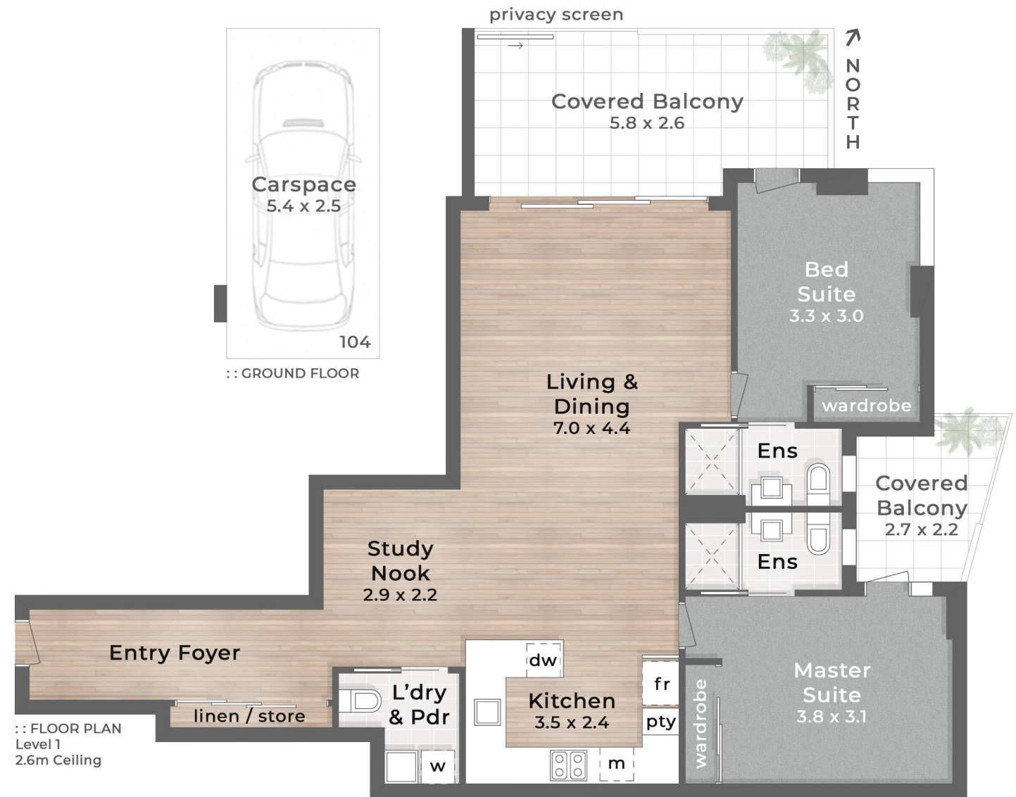
:: FLOOR PLAN Level 1 2.6m Ceiling