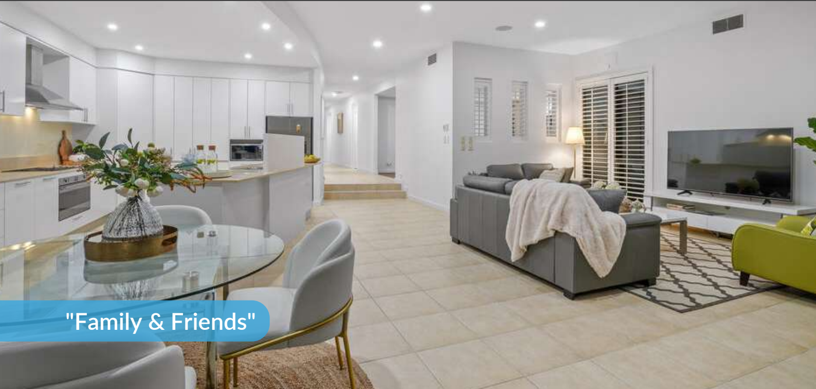
"Family & Friends"