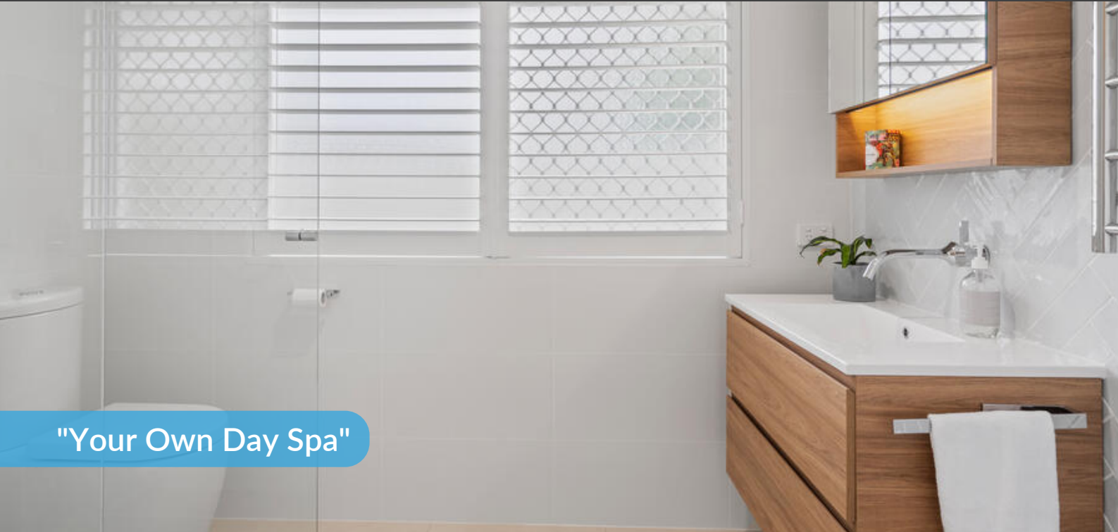
"Your Own Day Spa"