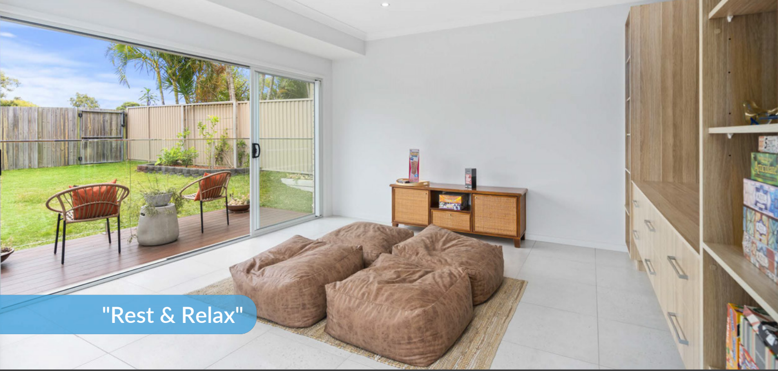
"Rest & Relax"