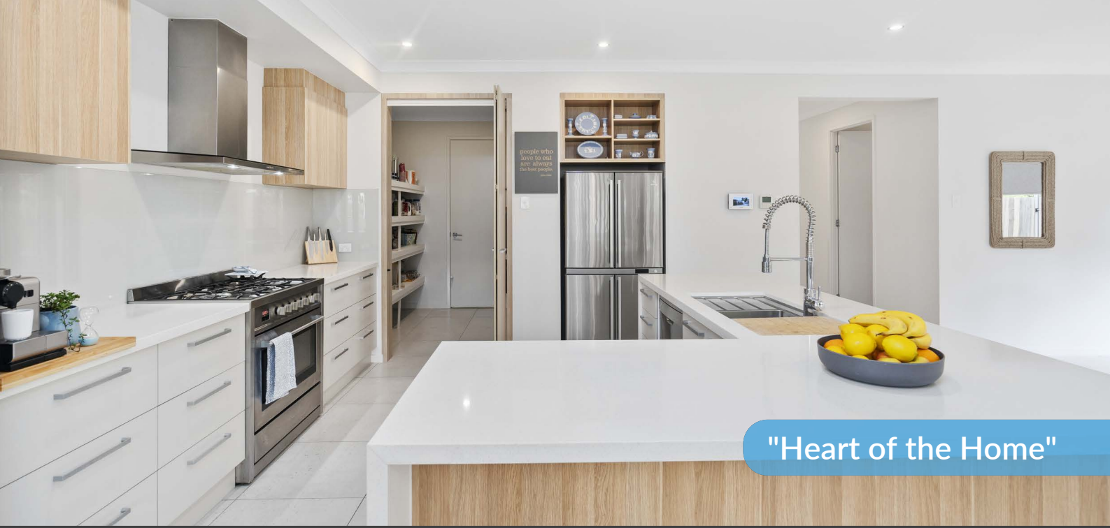
"Heart of the Home"