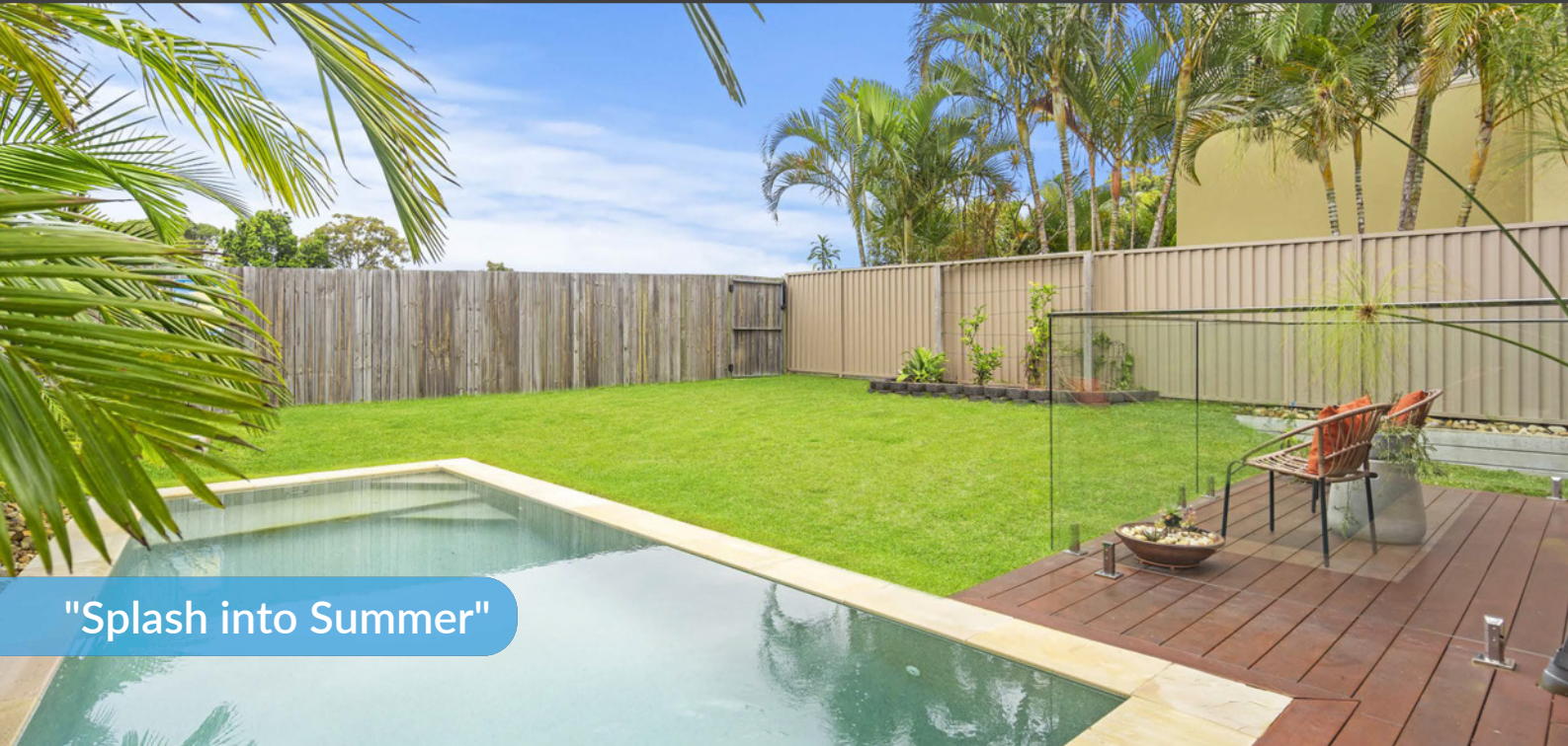
"Splash into Summer"