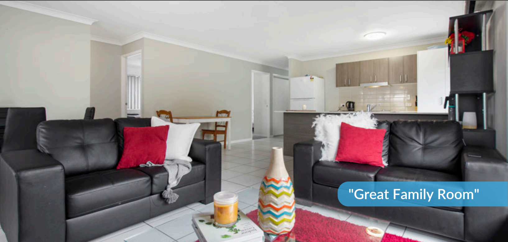
"Great Family Room"