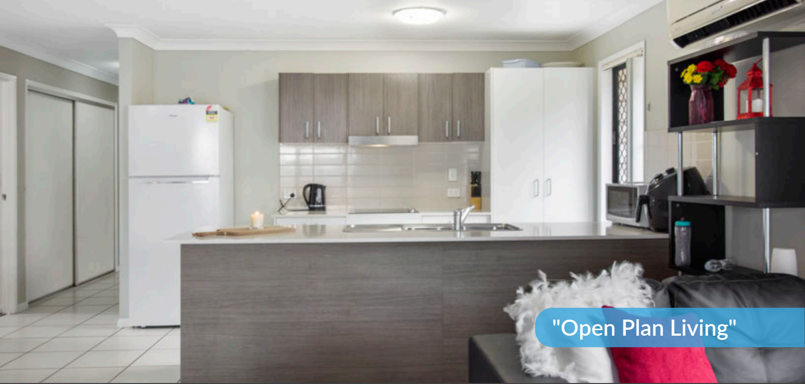
"Open Plan Living"