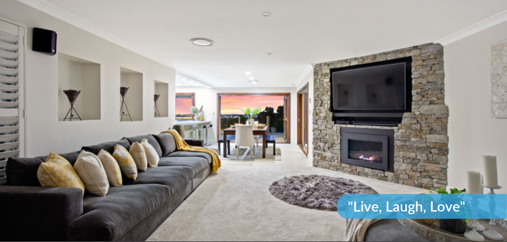
"Live, Laugh, Love"