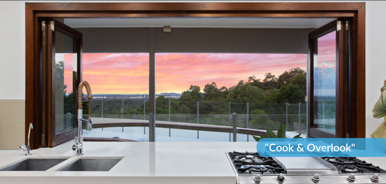
"Cook & Overlook"