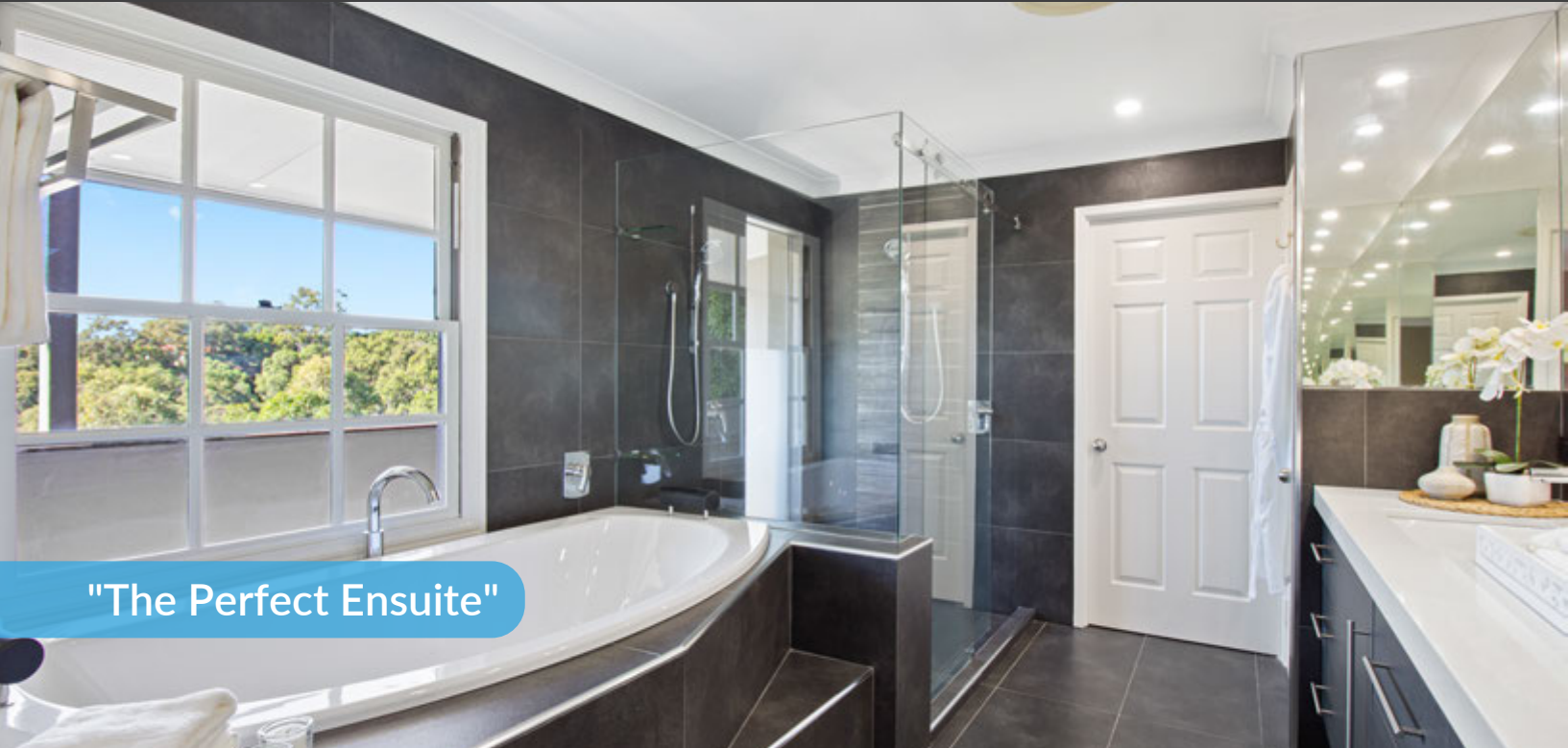
"The Perfect Ensuite"