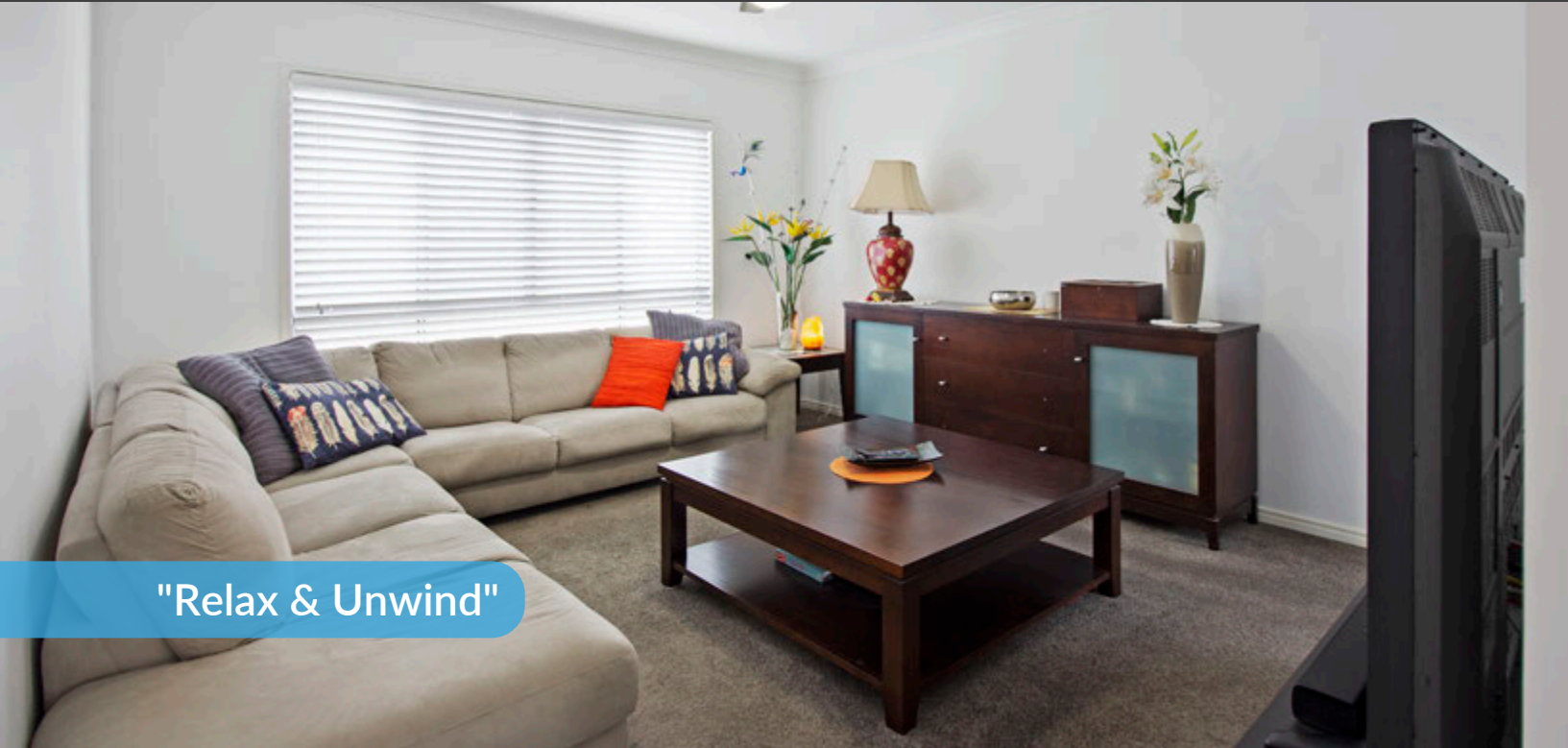
"Relax & Unwind"