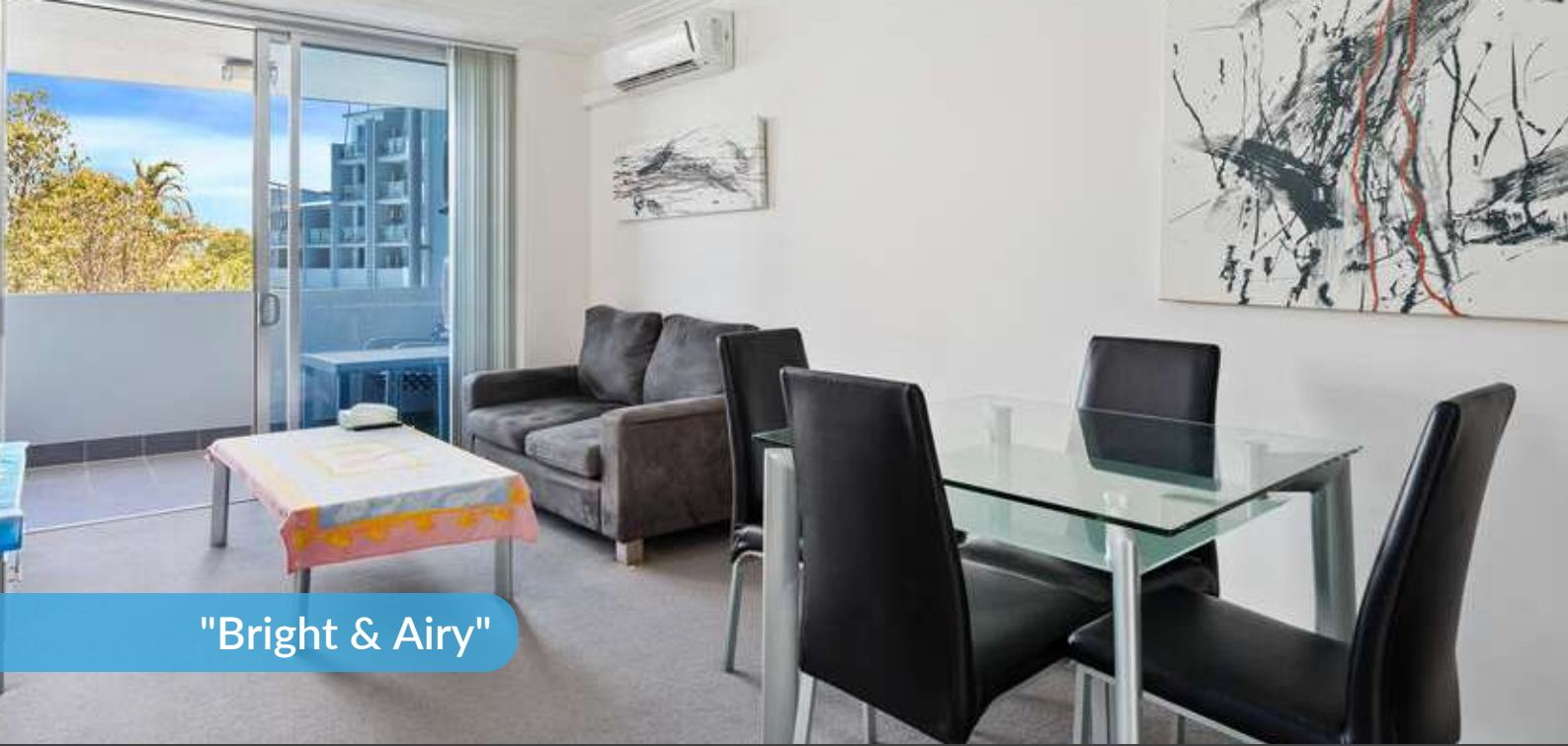
"Bright & Airy"