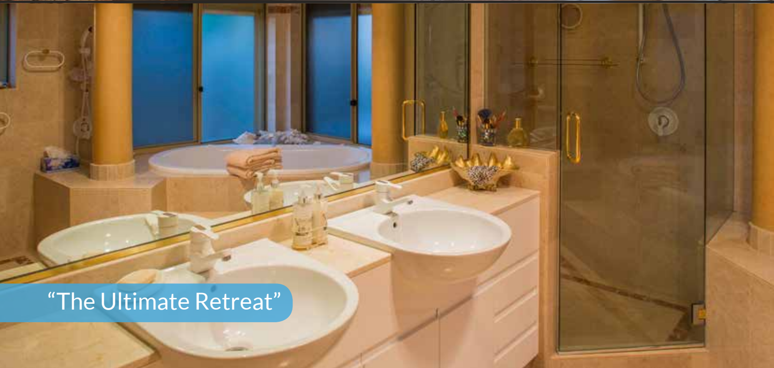
“The Ultimate Retreat”